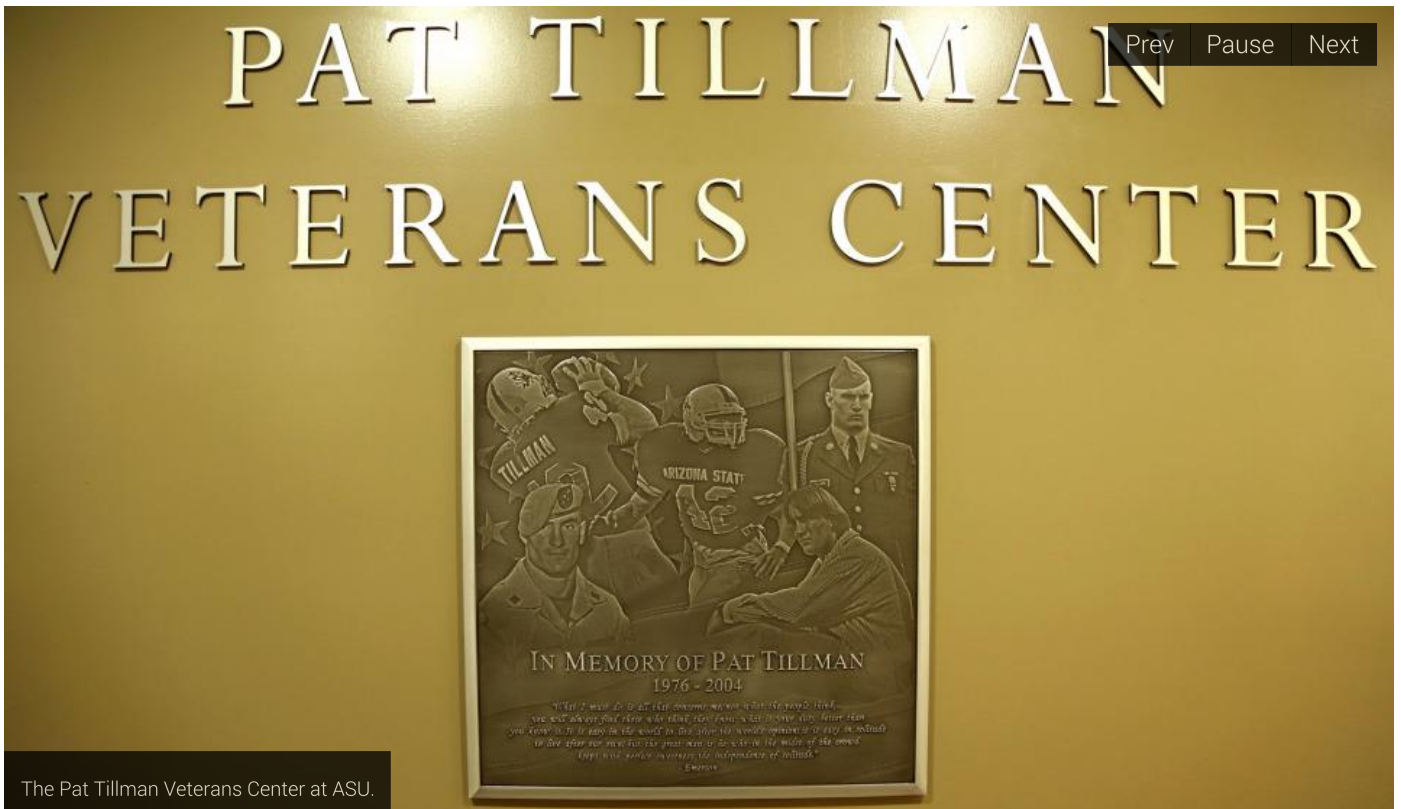
The Pat Tillman Veterans Center at ASU.