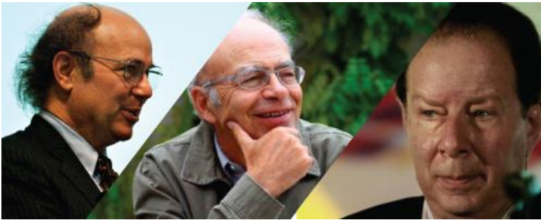
Frank Wilczek, Peter Singer & Sidney Altman

We regularly bring scholars and public intellectuals to ASU for extended periods, and are excited to welcome 2015-2016 Origins Project Distinguished Visiting Professors Peter Singer, and Nobel Laureates, Frank Wilczek and Sidney Altman.