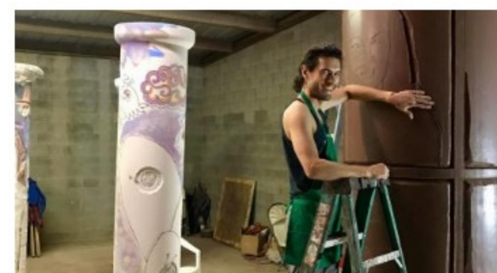
Pipe Brothers: Tom and James Franco