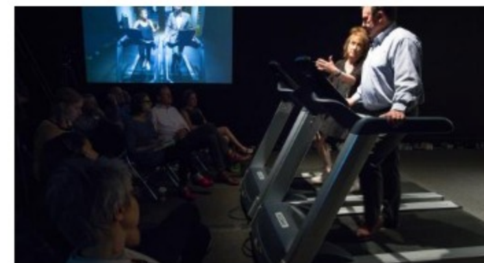
Finding solutions one step at a time