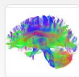
Executive Prowess Grows as Brain Hubs Silo