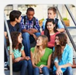
Streamlined Behavioral Therapy Helps Youths