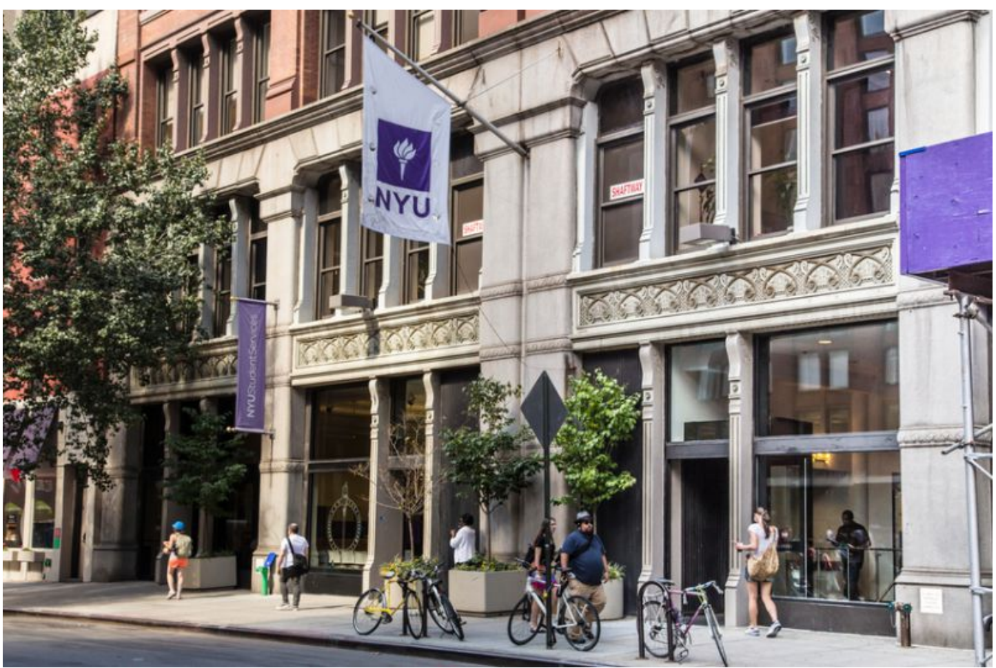
New York University

The best universities in the United States for graduate employability have been chosen by local recruiters. November 16 2016