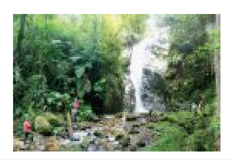
What can you with a geography degree? March 15, 2017