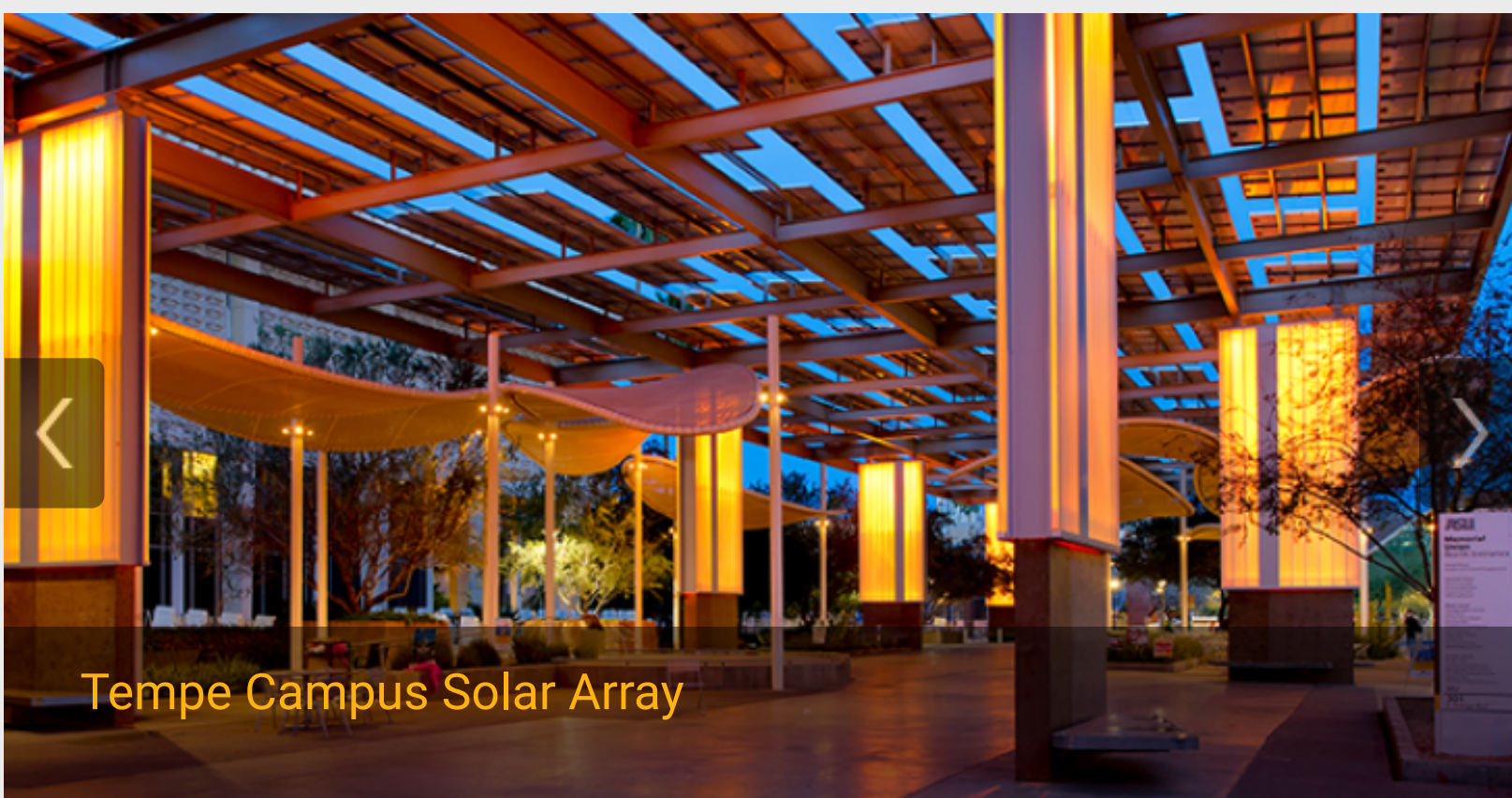
Tempe Campus Solar Array