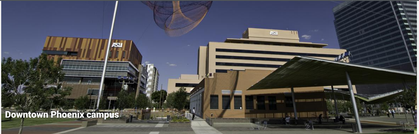
Downtown Phoenix campus