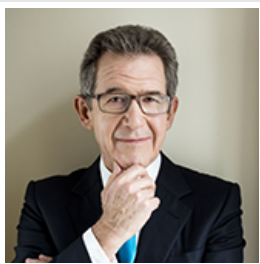
Lord Browne of Madingley

Member, Board of Directors of the Julie Ann Wrigley Global Institute of Sustainability at ASU