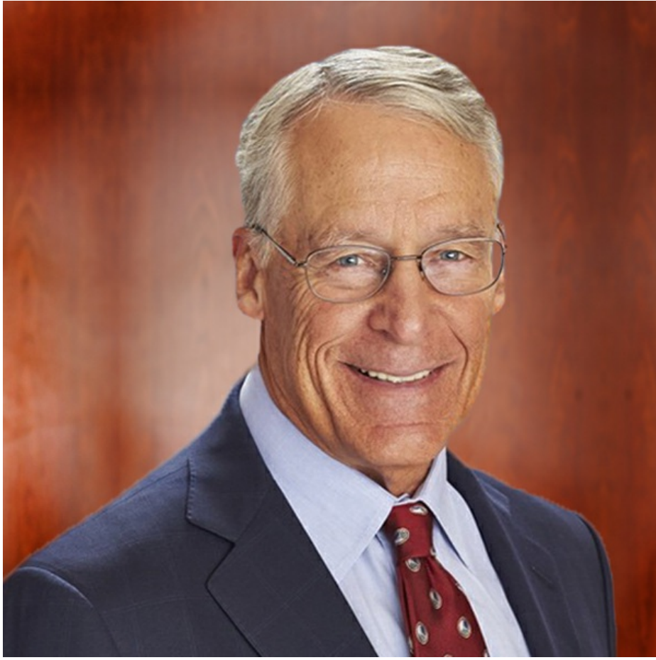
S. Robson Walton

Retired Chairman of the Board of Directors, Walmart