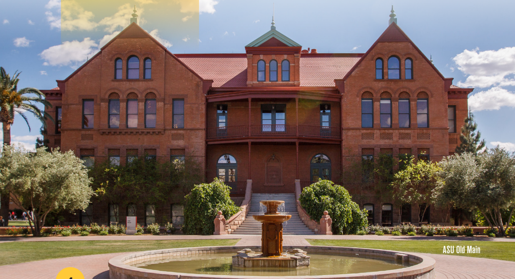
ASU Old Main