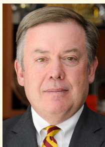
Michael M. Crow ASU President, Foundation Leadership Chair, Professor of Science and Technology Policy

All the speakers in this program are ASU senior leaders who were specifically chosen for their insight and expertise. Each speaker has invaluable skillsets that focus on acceleration, collaboration and innovation in higher education, with proven successes in impact and scalability. As leaders of their specific area, each speaker has played a critical role in the continued advancement of the ASU Knowledge Enterprise. Through interactive discussions, our speakers will provide clear examples of how ASU's design fosters innovation.